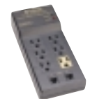
PC4 AC POWER CONTROLLER