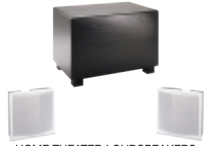
HOME THEATER LOUDSPEAKERS